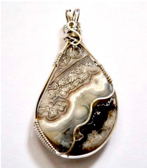
El Rincon lace agate, sterling silver wire (22 gauge square; 21 gauge half-round for bindings), Ellen Limeres.