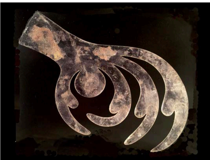
Platform pipes and cutouts from large sheets of mica (the claw is more than 12 inches long) were distinctive forms that make the work of Hopewell artists highly recognizable. Images: Wikimedia