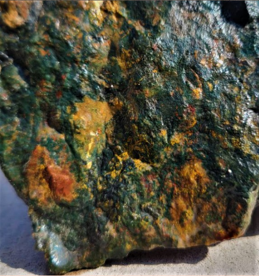
Bloodstone from our trip